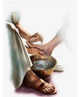
"You should wash each other's feet" (John 13:14).

A sincere thank you to the owners and staff of Moynihans Irish Bar (located up the road from the Chapel), who have always been a great support towards the People Helping People Project . They willingly accept any clothes, toiletries, or tinned food on behalf of PHP, that you may wish to donate. Thank you to all who have been leaving clothes and donations there in the last weeks. It has been greatly appreciated!